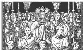
ASSUMPTION CHURCH 830 Huron Church Road Windsor, Ontario N9C 2P9 (519) 734-1335 / (248) 250-2740 www.windsordatinamas.org

Did you know that our weekly Latin/English Propers Handouts are now in use at a number of additional churches? Originally created as a joint project for the St. Josaphat and Assumption-Windsor Tridentine Communities, the handouts were based upon an attractive design created by The Saint Gregory Society at Sacred Heart Church in New Haven, Connecticut, and used with their permission.